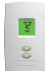
PRO 1000 Vertical Non-Programmable